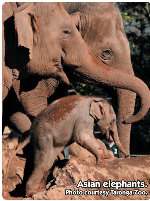
Asian elephants.

Asian elephants are more domesticated than _____ elephants, and are often put to work _____ things. Both male and female African elephants have _____, whereas only _____ Asian elephants have tusks. African elephants are also much _____, and of course heavier! They also have bigger _____. Like all elephants, they flap these backwards and forwards to keep cool. Woolly _____, which were ancient relatives of elephants, didn't have ear flaps. But they didn't need to to keep cool, they tried to keep warm with their big woolly _____.